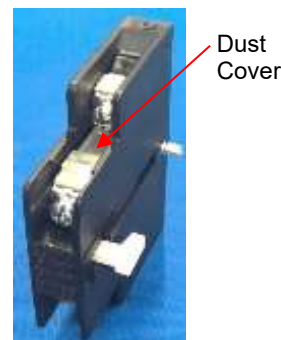
Fig2: Product Appearance(UN-AX80)