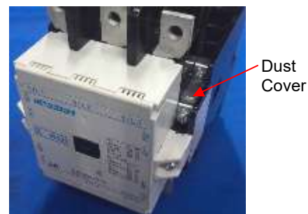
Fig1: Product Appearance(SL-N125)